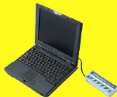
Easy connecting to PC

* 1: Only 4 digits of the counter can be viewed on the display of the unit. To view the 5 digits internal counter value, please use the communication feature of the unit to recall the data.