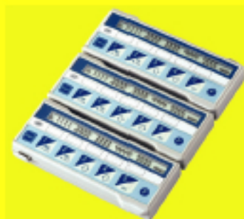
Easy to line up some Pocket counters